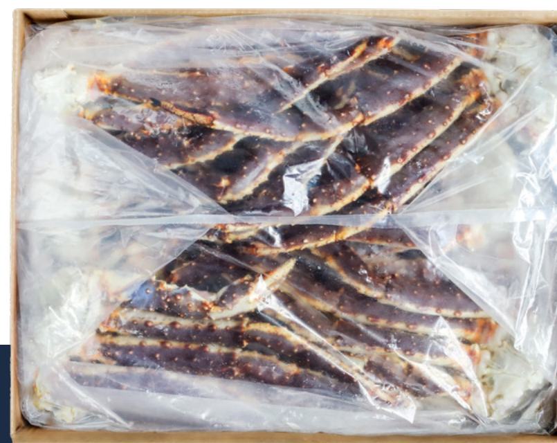
Red King Crab in tape