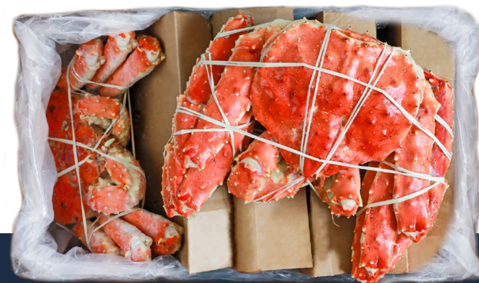
Whole Red King Crab