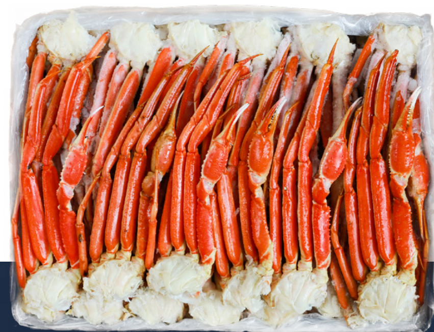
Opilio Snow Crab