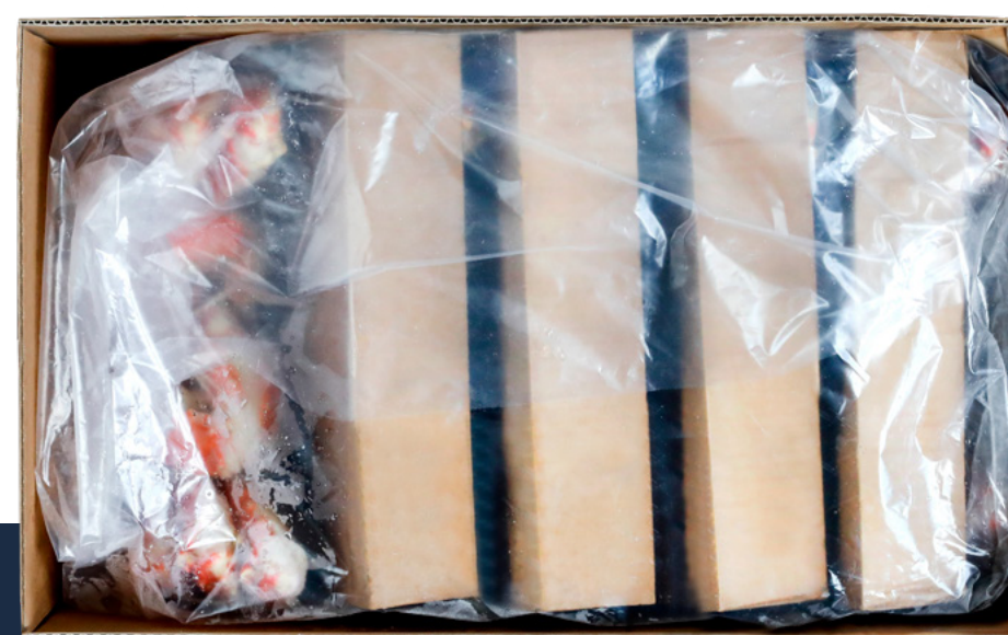
Whole Red King Crab in tape