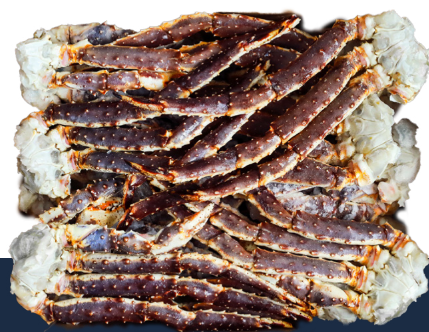
Red King Crab