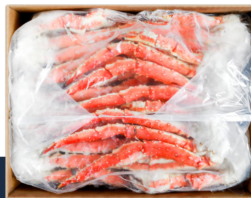
Red King Crab in tape