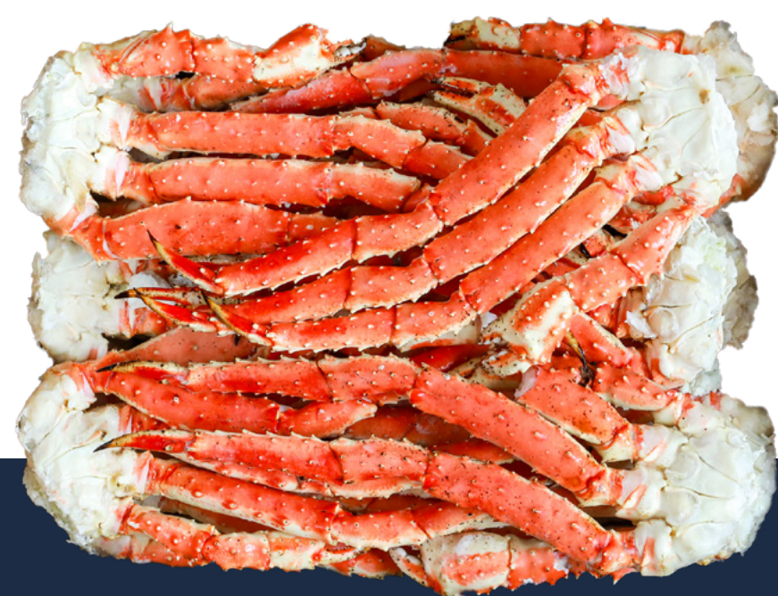
Red King Crab