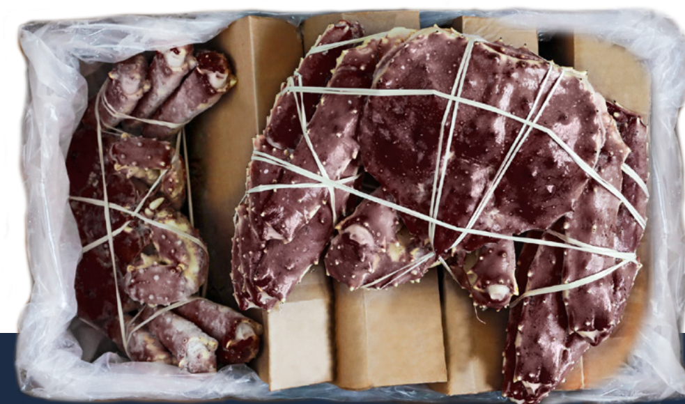
Whole Red King Crab