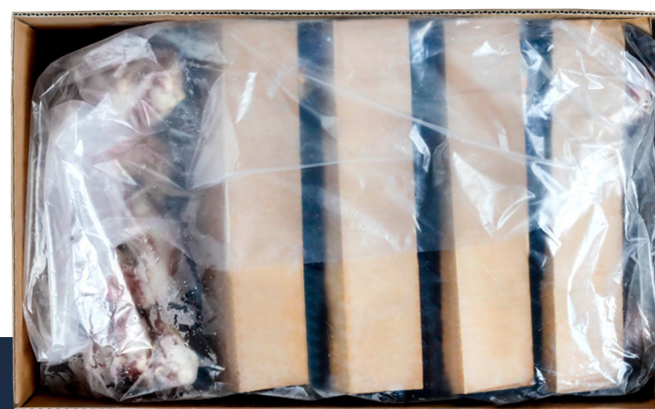
Whole Red King Crab in tape